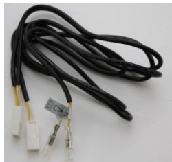
(5) Cable B