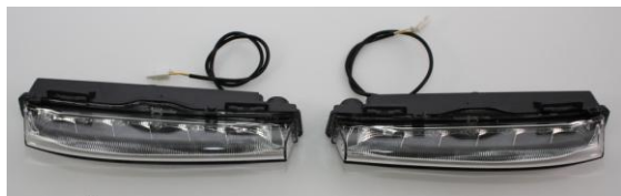
(1) Daytime running light

The following parts are included in the kit of W212 daytime running light: