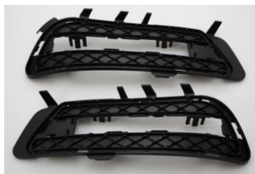
(2) Daylight net support