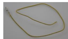
(7) Cable D