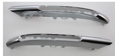
(3) Chrome molding